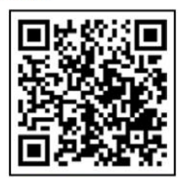
Book Fair Payment

Make a secure payment online by going to scholastic.com.au/payment or scanning the barcode below.